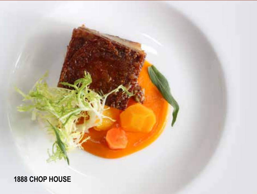
1888 CHOP HOUSE

Roll on up to our Sushi Bar and dive into the freshest sushi in the Rockies!