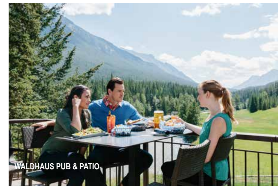
WALDHAUS PUB & PATIO

Celebrate summer on the Lookout Patio, offering the best views of the Bow Valley and authentic fare.