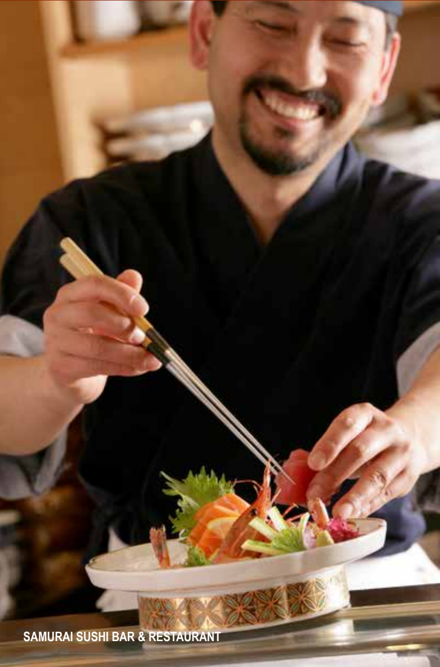
SAMURAI SUSHI BAR & RESTAURANT