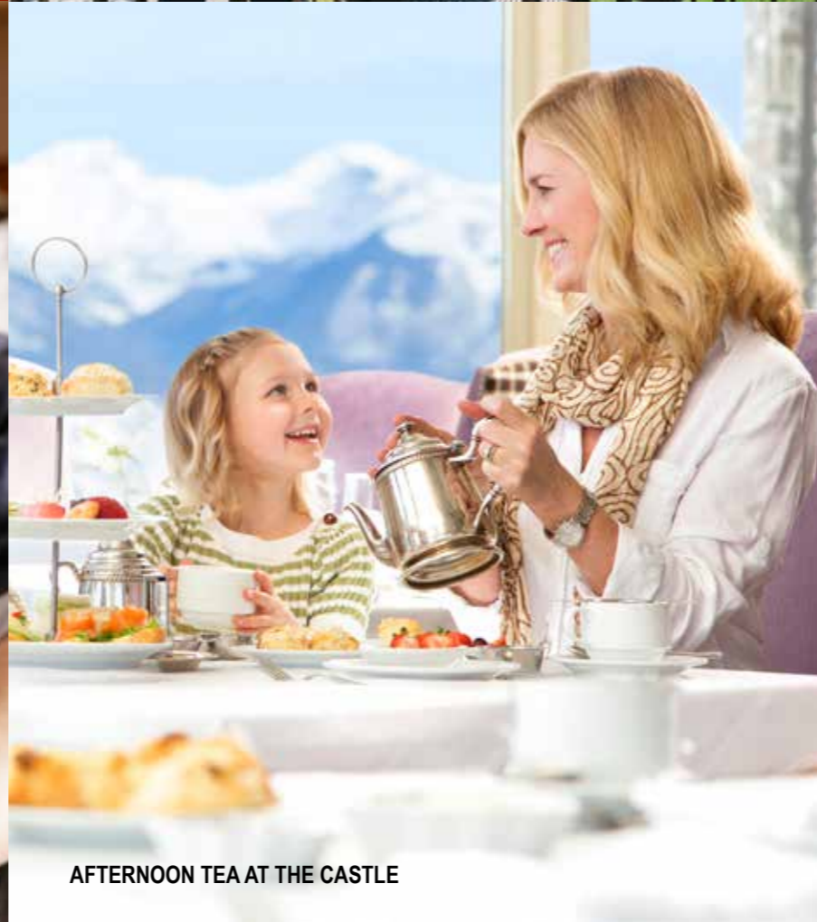
AFTERNOON TEA AT THE CASTLE