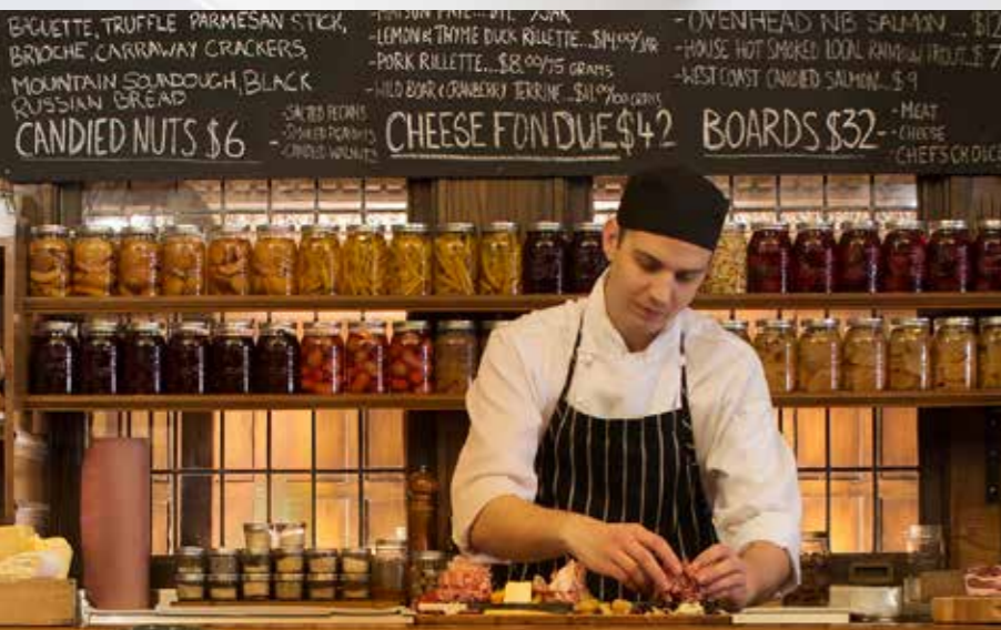
GRAPES WINE BAR