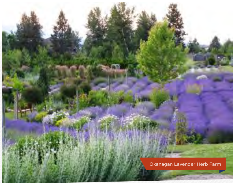
Okanagan Lavender Herb Farm