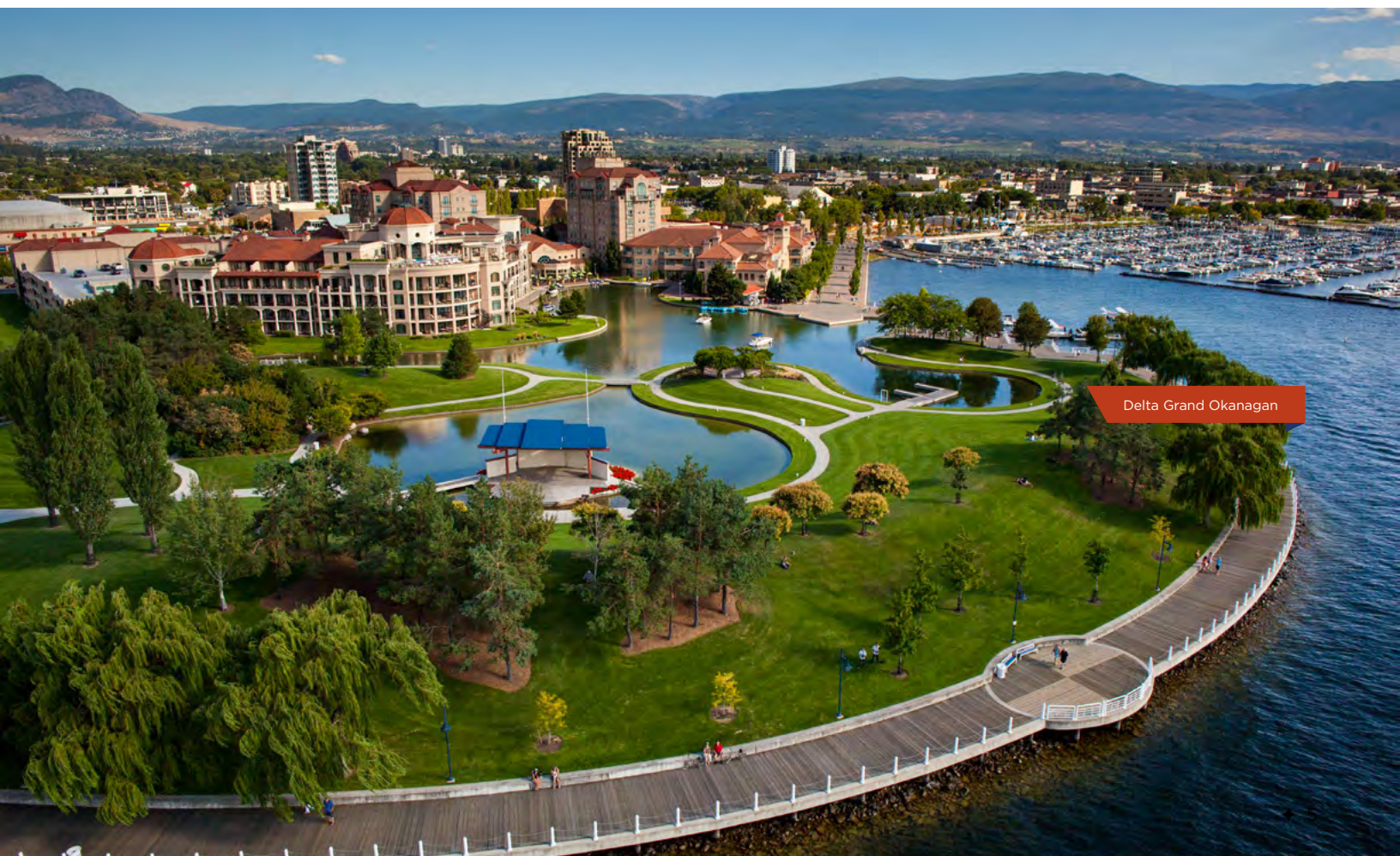
Delta Grand Okanagan